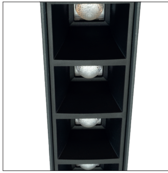
PREMIUM1 UGR<19 lens