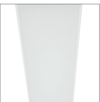
OP white acrilic diffusor