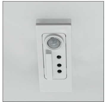
XC daylight&occ sensor